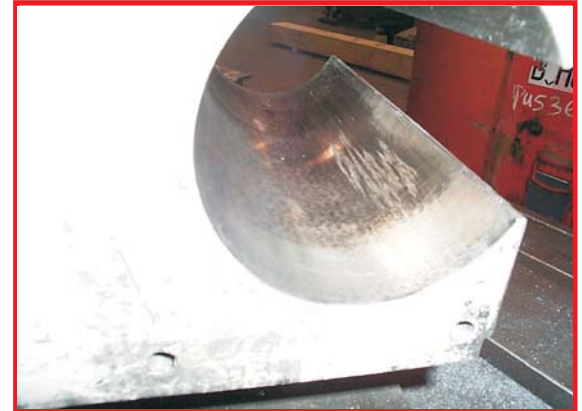
Core Box To Be Repaired