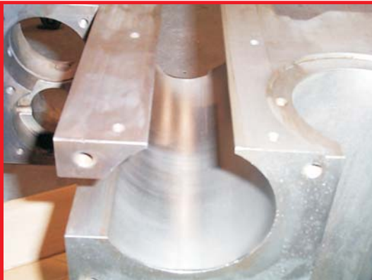
Core Box Coated